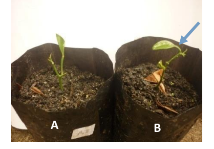
Fig.1. Shoot cuttings of Citrus amblycarpa L. age of 4 weeks: A, Treatment control 0.0 ml L<sup>-1</sup>. B, Treatment of 10 ml L<sup>-1</sup> Atonik.

Application of 60 ml L<sup>-1</sup> Atonik effectively enhance the growth response of leaf length on stem cuttings of Citrus amblycarpa , up to be able to obtain the highest leaf length of about 2.8 cm per buds (28 times higher than the control) at week 4 after planting. This treatment was significantly different compared to control and other treatments on stem cuttings. Best growth response resulting from the application of 60 ml L<sup>-1</sup> Atonik on stem cuttings of Citrus amblycarpa that can effectively stimulate shoot height, leaf length, and number of buds at the age of 4 weeks after planting, can be seen in Figure 2 . Application of 60 ml/L Atonik on stem cuttings, also can effectively enhance the best growth response up to be able to obtain the highest number of buds about 2.8 buds per stem cuttings. This treatment is more effective than control and other treatments on stem cuttings and stem cuttings of this Citrus. Growth response on shoot cuttings and stem cuttings of this Citrus amblycarpa L. after giving of Atonik at week 4 after planting, can be more clearly seen in Figure 3 .